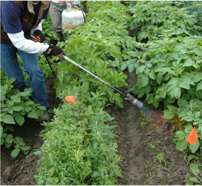
Flame weeding controls weeds within the potato row and on the sides of raised potato beds.

chopping action to remove the weed roots or pulling entire weeds by hand can damage the tubers.