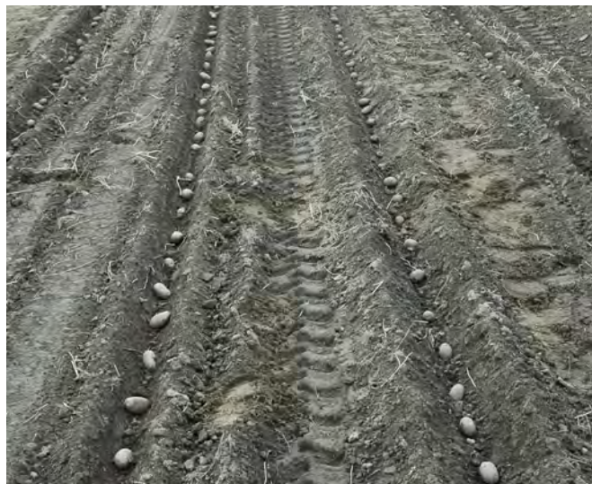
Seed potatoes can be planted in furrows (above) or mounds.