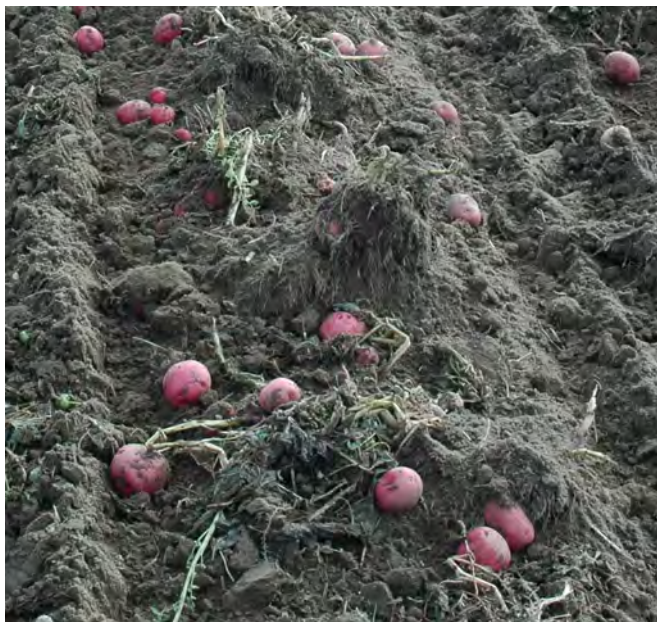
Cutting back the vines one to two weeks before harvest allows the potato skin to toughen before storage.

While the optimal storage condition for potatoes is a dark, cool, high humidity area, most homes are not equipped to meet the exact storage standards used by commercial producers. Simply storing your potatoes in a cool place where they are not exposed to light or at risk of freezing will suffice for a few months. If the potatoes freeze, they will fall apart once they are thawed and become inedible. A few