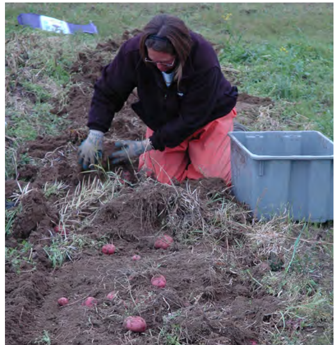
Potatoes can be harvested both during the growing season and at the end of the growing season.

Single drop seed pieces are small potatoes, 1 to 2 inches in diameter, which are planted whole. Some gardeners will pay a premium for single drop potatoes because they do not need to be cut be-